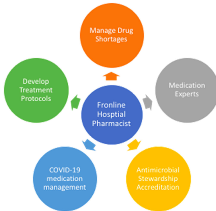
Fig. 2 Key Responsibilities of Hospital Pharmacists amid COVID-19

trials. When the vaccine against COVID-19 is available, pharmacists will be considered one of the frontline health workers that should be permitted to give immunizations. Given the past success of community pharmacists with increasing annual seasonal influenza uptake and their accessibility, pharmacists will need to be central in administering COVID-19 vaccines in order to achieve rapid population-wide coverage. Furthermore, screening and testing patients for COVID-19 are both crucial interventions to flatten the curve. Pharmacists in Alberta are screening patients daily and referring them to nearest testing facilities [7]. While American pharmacists may order and administer FDA-approved tests [8]. Increasing the accessibility of testing is imperative if countries wish to escape lockdowns.