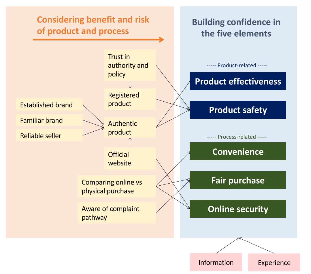
Fig. 2 Consumers' considerations regarding the product, online seller and e-commerce platform, which subsequently build their confidence in the five elements prior to the online purchase of health supplements and natural products

Although consumers cannot easily confirm the authenticity of an online product, they develop their confidence in the product's authenticity through a variety of means, including opting for a product from an established brand, selecting an online product that they have previously seen in a physical pharmacy shop, or making an online purchase from a reliable company or seller. Consumers consider a product from a well-known brand to be safe