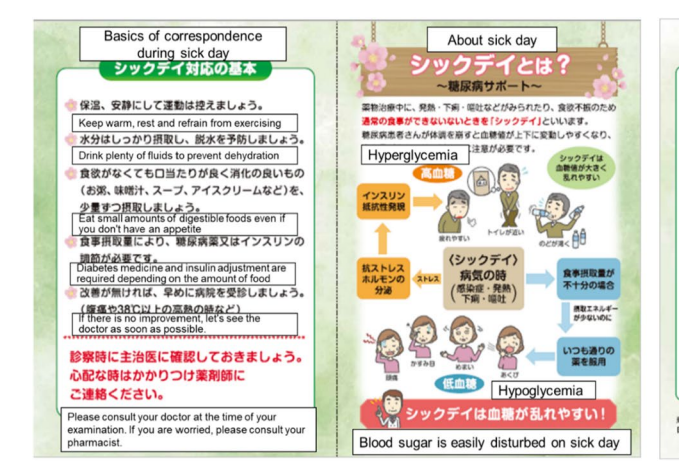
Fig. 1 Sick-day card.

the first survey, when the patients revisited the pharmacy after appointment with a physician.